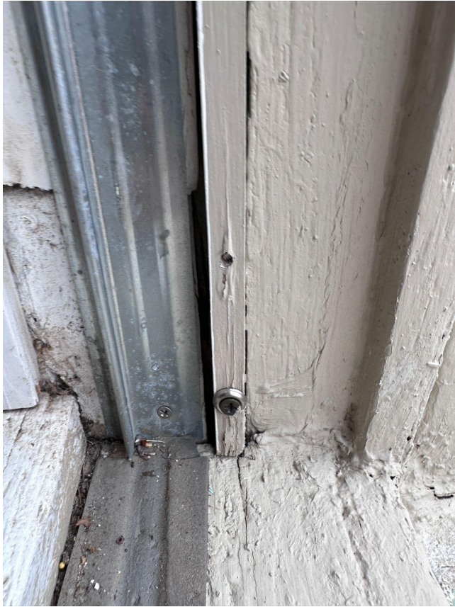
The parting stop is screwed on for easy removal.